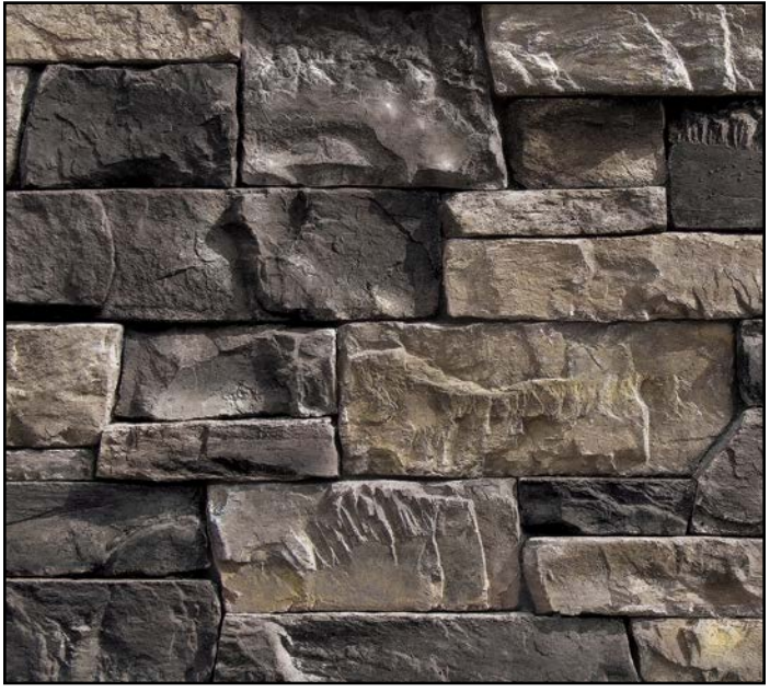
OLD COUNTRY LEDGE

When purchasing Old Country Ledge, coverage is based on installation with a <sup>1</sup>/<sub>2</sub>" joint at the back of the stone.