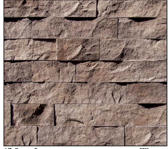
3" SPLIT LIMESTONE