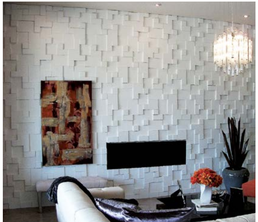
Lennox Stone - Painted White