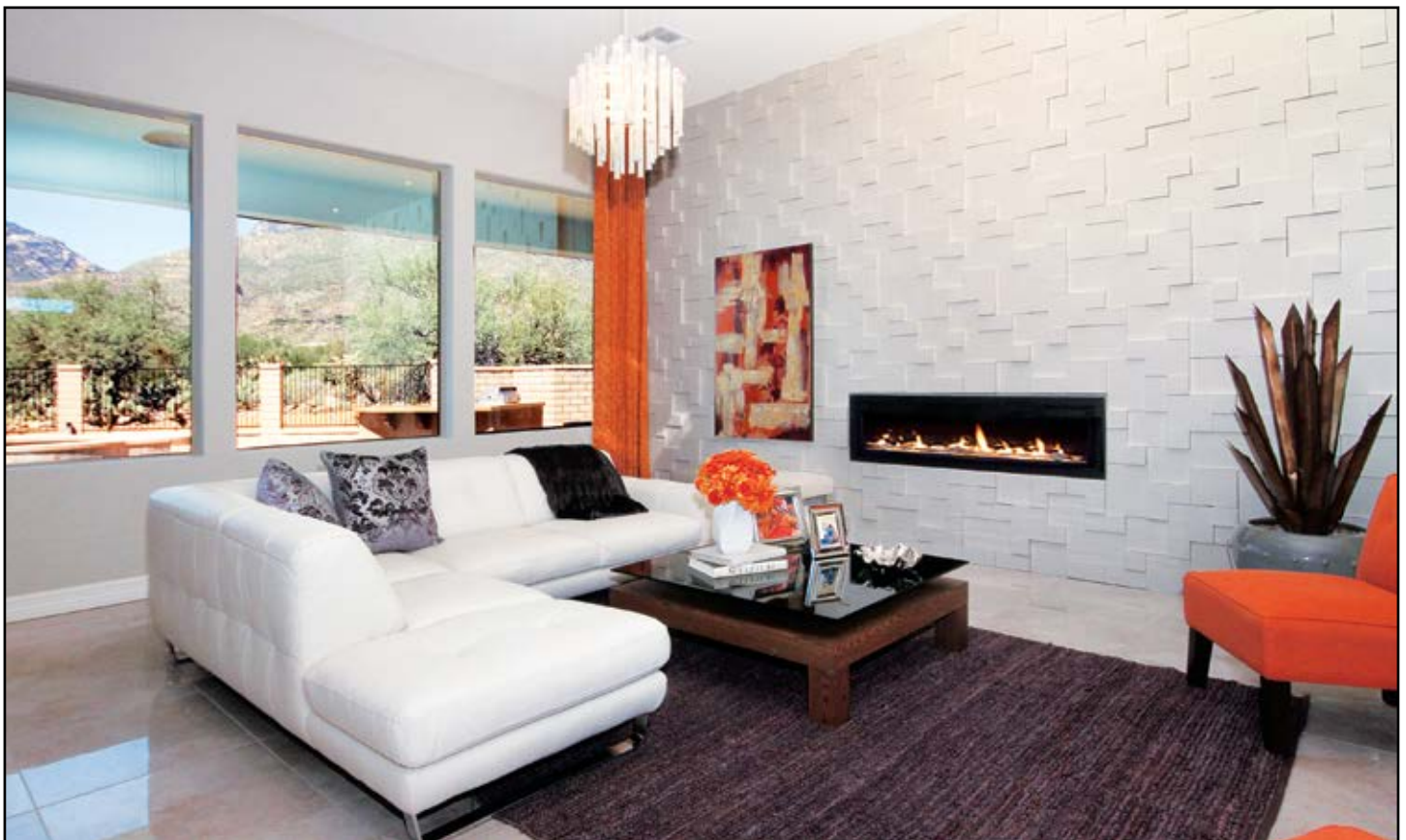
Lennox Stone - Painted White