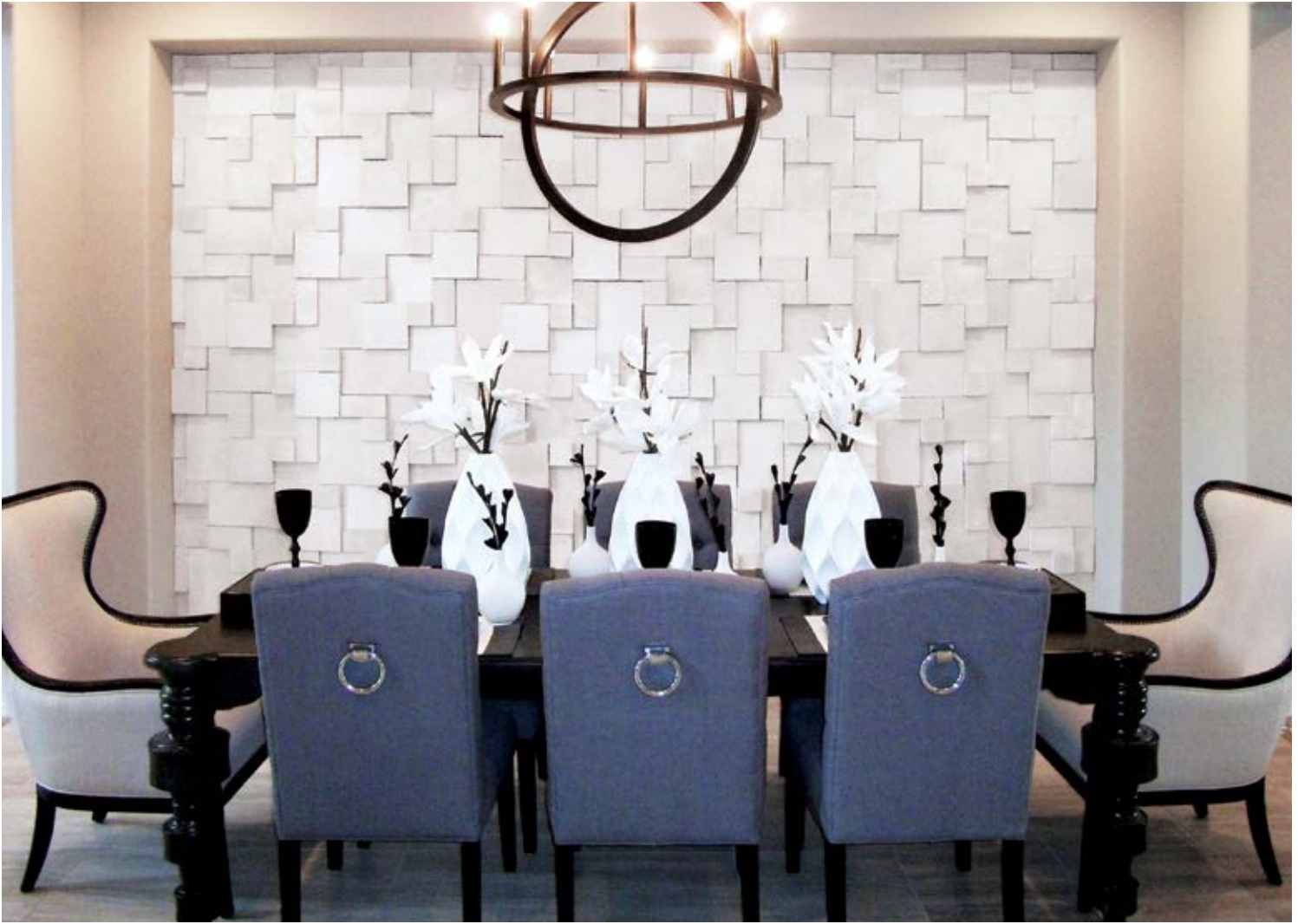
Lennox Stone - Painted White